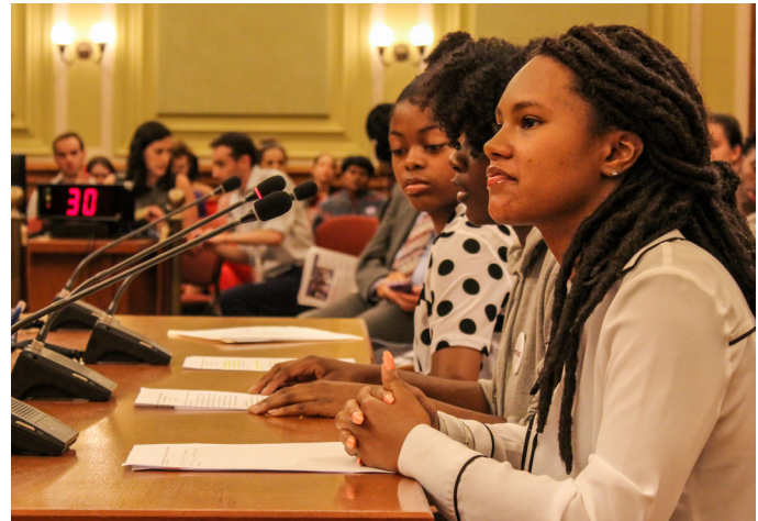
Young people testify on legislation to lower the voting age at a D.C. Council Committee on the Judiciary and Public Safety hearing, June 2018.

In July 2018, following research and education efforts led by students on the Mayor’s Youth Commission and other high schoolers, city councilors voted unanimously in support of a resolution to lower the voting age to 16 in Northampton. A home rule petition is expected to be introduced in the state legislature in 2020. 44