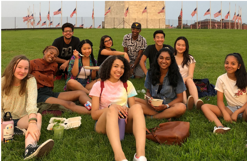
Vote16USA Youth Advisory Board members at the board retreat in Washington, DC August 2019

The Vote16USA Youth Advisory Board is comprised of young people from around the country who are working to advocate for 16-year-old voting in their cities or states. Board members help guide Vote16USA's national efforts, ensure that young voices remain at the center of the initiative, and support each other's local campaigns by sharing best practices and learning from other members' experiences. Youth Advisory Board members serve one-year terms beginning in the early summer.